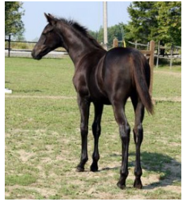
Photo is of colt STORR (Stallone / Ockeross) – one of the wonderful babies that was born at Centaur Breeding Farm.